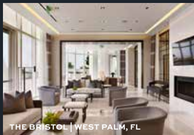
THE BRISTOL | WEST PALM, FL