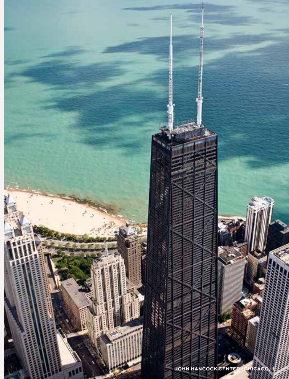
JOHN HANCOCK CENTER | CHICAGO, IL

*Assets Owned & Operated and Residential Units Managed are the estimated total capitalization of assets and units owned and operated by Golub and its partners since inception. The Gross IRR and Properties Represented is related to all realized investments since the succession of the current executive leadership in 1995. Information was produced by Golub and is unaudited.