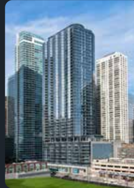
MOMENT Chicago, IL

Scope & Role: Developer (2018), Sales & Marketing