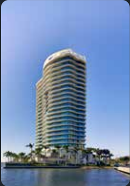
THE BRISTOL West Palm Beach, FL

Property Details: 60 unit condo development