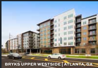
BRYKS UPPER WESTSIDE | ATLANTA, GA