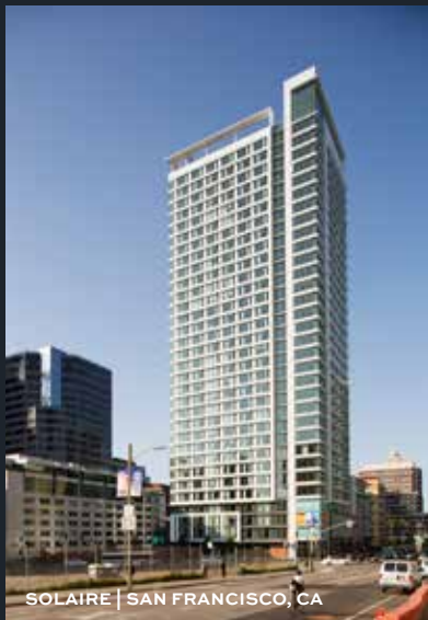
SOLAIRE | SAN FRANCISCO, CA