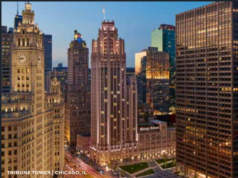
TRIBUNE TOWER | CHICAGO, IL