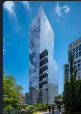
PARK TOWER San Francisco, CA

Scope & Role: Developer (2016), Management, Leasing & Marketing