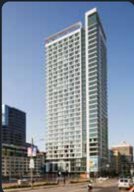
SOLAIRE San Francisco, CA

Scope & Role: Developer (2016), Management, Leasing & Marketing